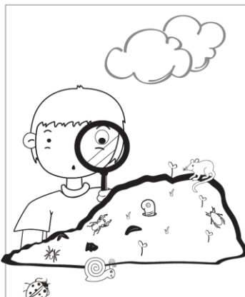
Soils are Living