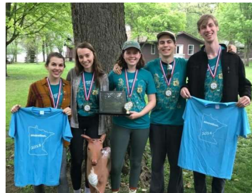
2018 State Envirothon 1 st place winners from Hopkins High School